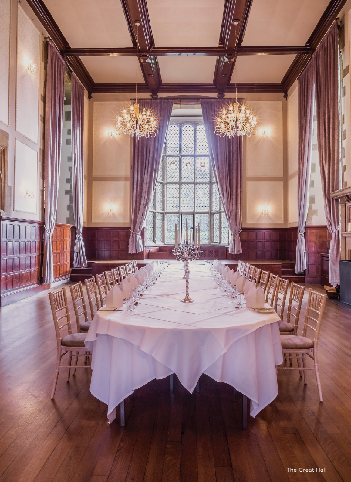
The Great Hall